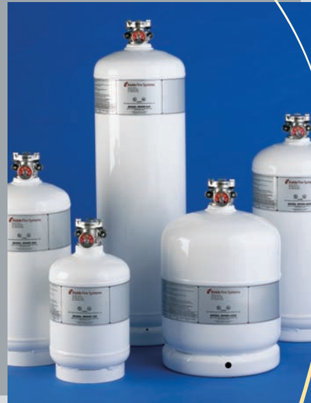
Kidde WHDR System

Investing in a Kidde WHDR System guarantees more than compliance with UL Standard 300, NFPA 96, NFPA 17A and insurance codes—it provides protection from the devastating consequences of a fire.